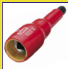
Ratchet Allan Key