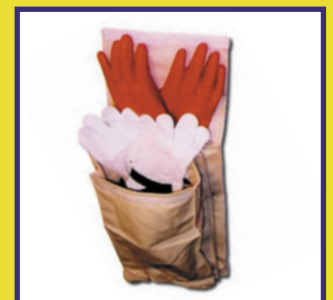
Canvas Glove Bag