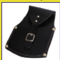
Hatchet & Axe Protector