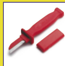
Knife with Insulated Back