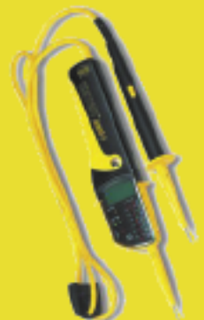
▲ Item # 111 422 Unitest 2000 Beta-LED/Digital Display, IP 65, Self test, Phase sequence indication, 12-690V, 1-19990hm, Continuity, IEC LR 603, Illumincation of display