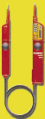
▲ Item # 111 428 COMBI Pol - IP 65 - Solar 12-690V AC/DC / 0-1 Mohm-Phase sequence indication, IEC 61243-3 / VDE 0682 Teil 401

Catalogues displaying CIMCO's full range are available on request.