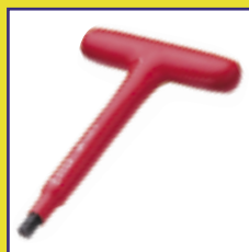
T-Bar Allan Key