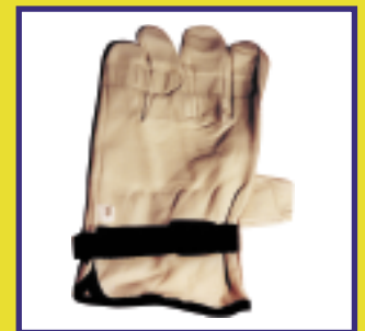
LV Outer Gloves