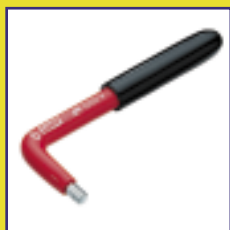
Angle Allan Key