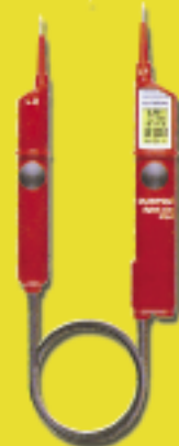
▲ Item # 111 427 Duspol Digital IP 54 - 1.5-750V AC/DC Phase sequence indication, IEC 61243-3 / VDE 0682 Teil 401