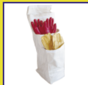
Live-Line 3 Compartment Glove & Sleeve Bag