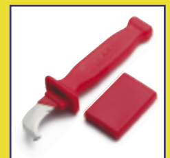
Cable Stripping Knife