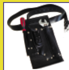
Tool Pouch with Leather Belt