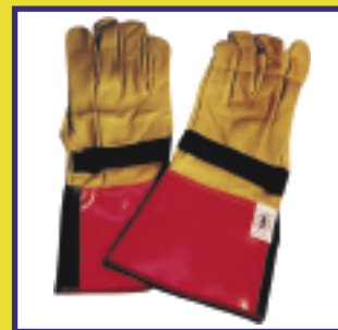
HV Outer Gloves